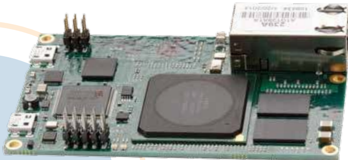
Actual Size - Top