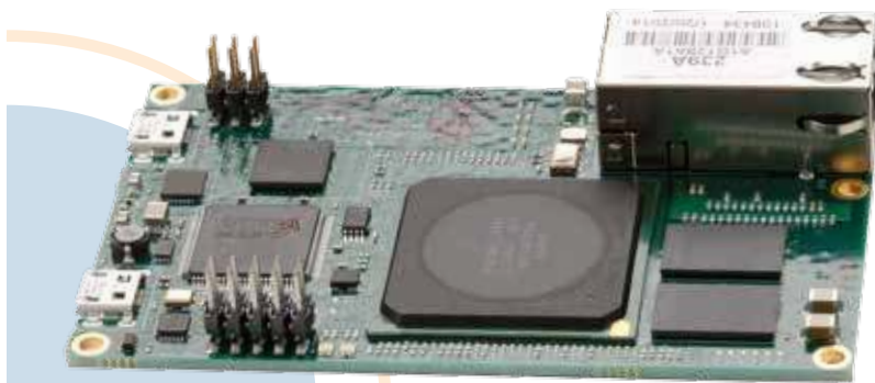
Actual Size - Top