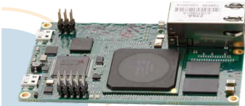
Actual Size - Top