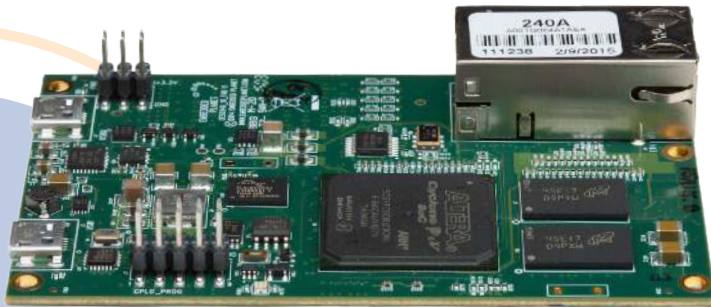
Actual Size - Top